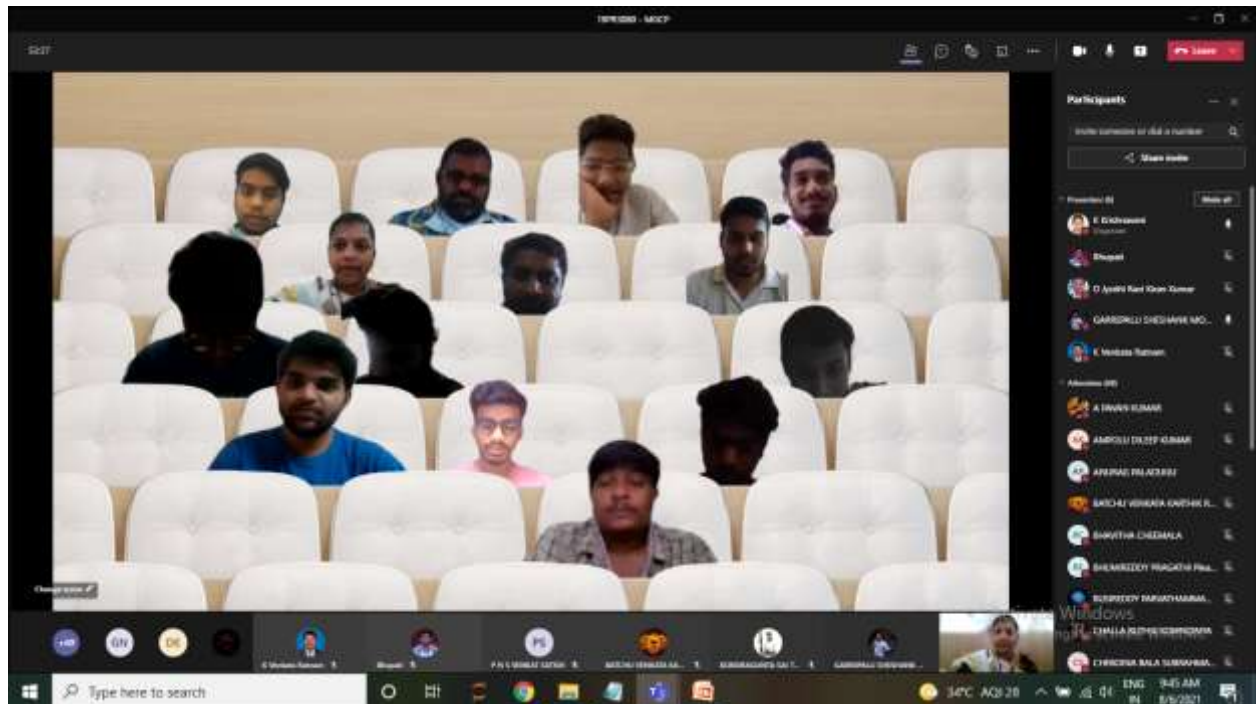
Fig. 3. Participants Virtual Interaction with ALUMNI