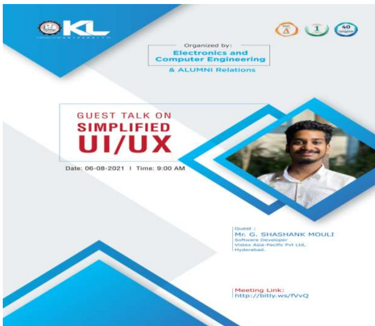
Fig. 1. Brochure towards ALUMNI Guest talk